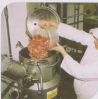
▲ Food Processing Unit

Instruments sterilisation corrosion inhibitors added