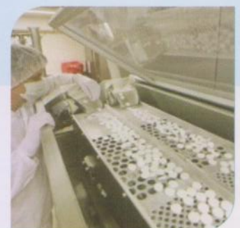
▲ Sterile Section

Exclusively Marketed by Steri Point Inc. , Bangalore Email: steriointinc@yahoo.in Mfd.: Becta Laboratories, Gujrat, India