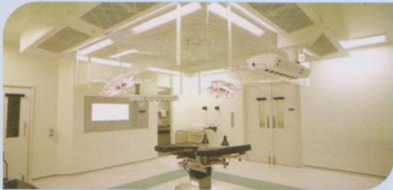
◀ Operation Theatre

ALDEVON Ensures Excellent cleansing, with Rapid disinfection within 15 to 30 min. with Prolonged residual action, Eco friendly, Bio-degradable, Non irritant & Nontoxic.