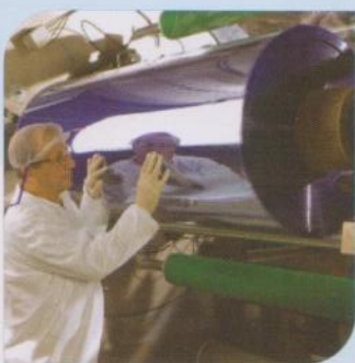
◀ Pharmaceutical manufacturing

Acts on both DNA & RNA crosses cell wall membrane and destroys the material responsible for cell replication.